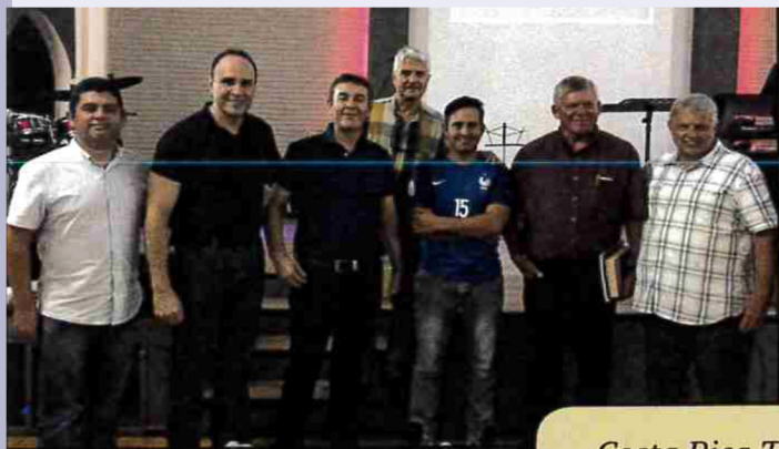
Costa Rica Teaching Team

An amazing response to the gospel of grace was the highlight of our August workshop in the mountains of Costa Rica. Following our teaching on the book of Romans, several people stood up and told the group that they had never understood salvation by faith in the finished work of Jesus Christ before. Others said they had lived in fear of losing their salvation and were now