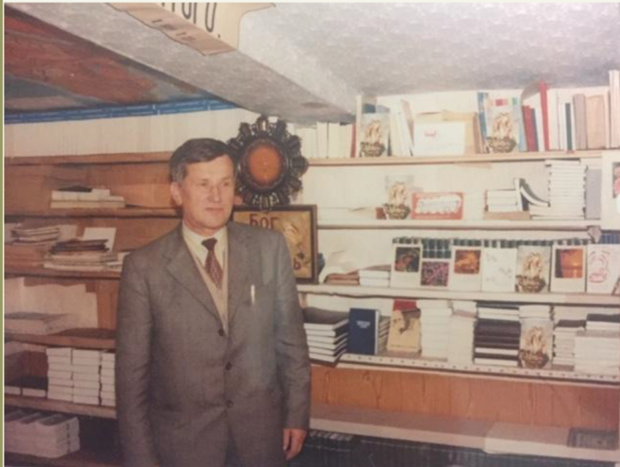
Dad in his hiding place - secret office- packing Bibles