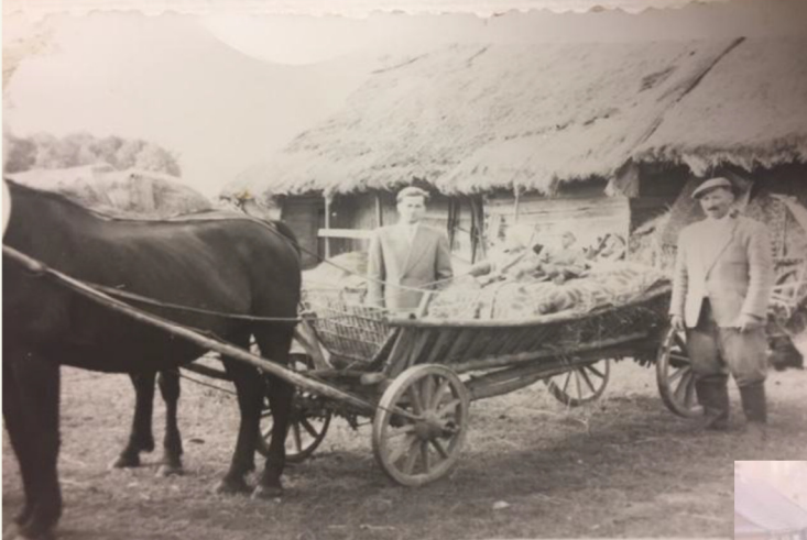
Dad on the farm with my granddad (me and my brother on horse carriage).

We were a poor family. Dad had to work hard to provide for the family. He worked in an office in a nearby city, traveling there by train every day and then returning home late in the afternoon riding his motorbike 10 miles to his parent's farm which had no electricity. There was no plumbing and no running water. Water was from a well in our front yard.