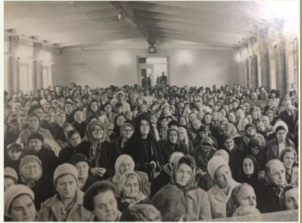
Underground church in Russia.