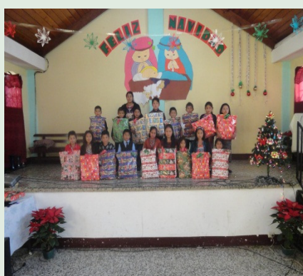
2ND & 3RD GRADERS