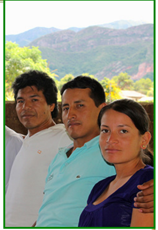
A hearty welcome to DM2, a mission group now supported by Sugar Land Bible Church

Pray for DM2 as we need strength, stamina, and direction for the future. Pray for teams on the different fields to have success as they teach people in their own contexts.