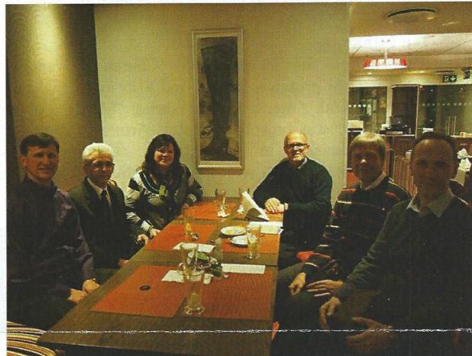
Meeting with Lithuanian pastors about the mission project

We had two long meetings with them, training them and introducing the "Operation Andrew" tool - material from the Billy Graham Evangelistic Association.