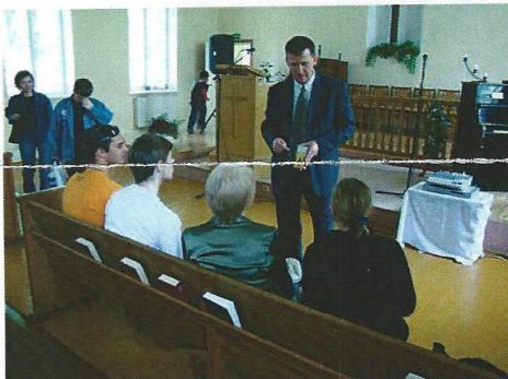
Counseling new converts in Kaunas, Lithuania