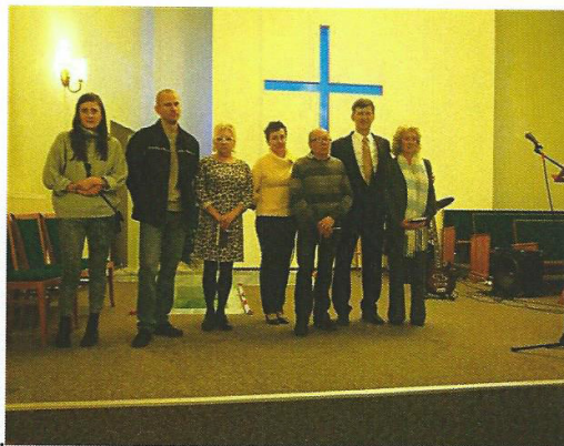
New converts at Lodz Baptist Church